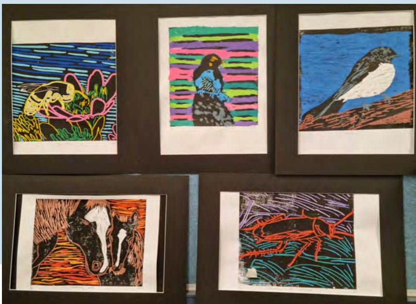
Year 10 linos