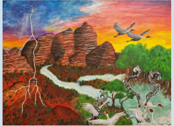
Purnululu Cassie Yr11