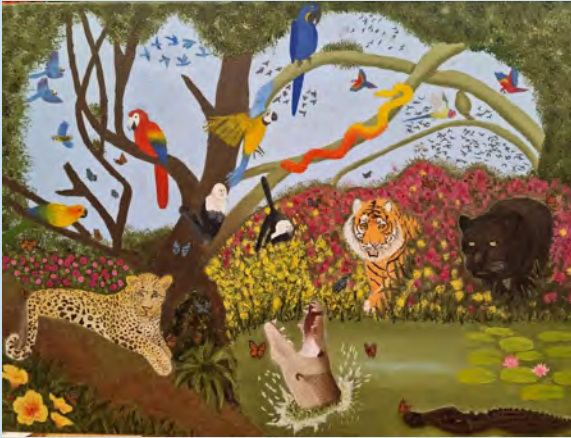
Jungle Aishlynn Yr12

Wow what an amazing term of Art. The students have excelled in so many ways. The highlight was when the students went to view the Angelico Art Exhibition and saw their own art on the walls. So much art to enjoy.